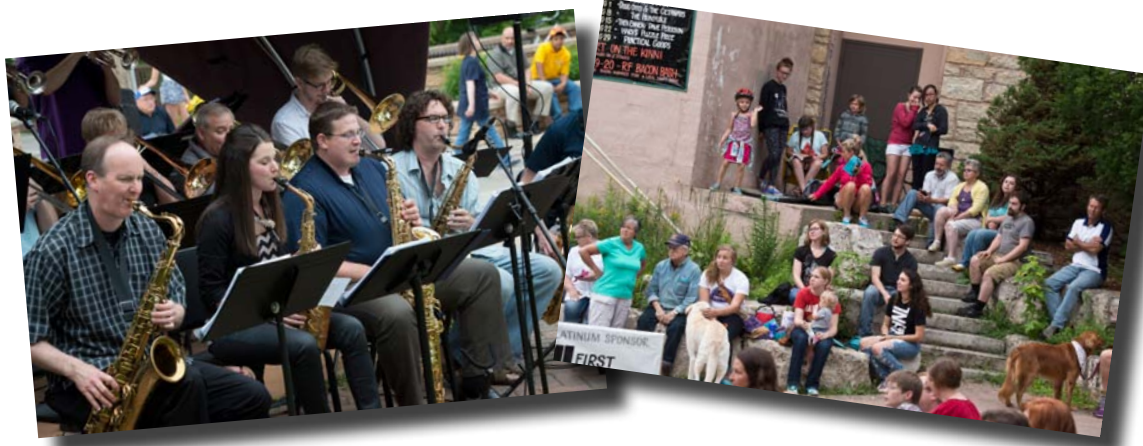
Music in the Park!