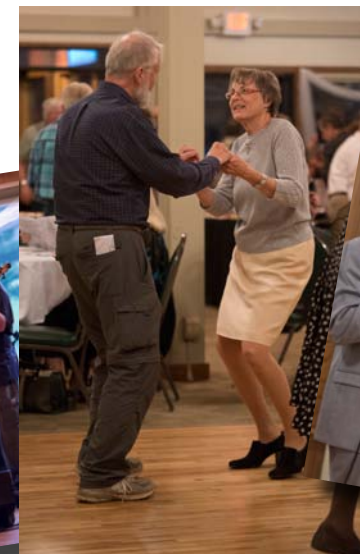
Spring Arts Gala!