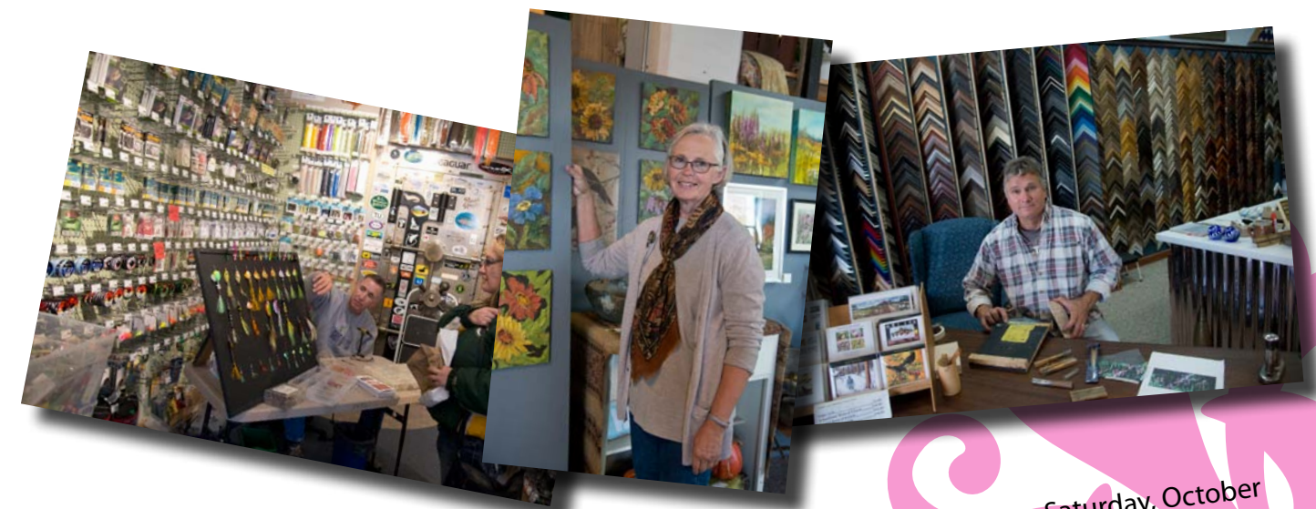
Main Street Art Crawl!