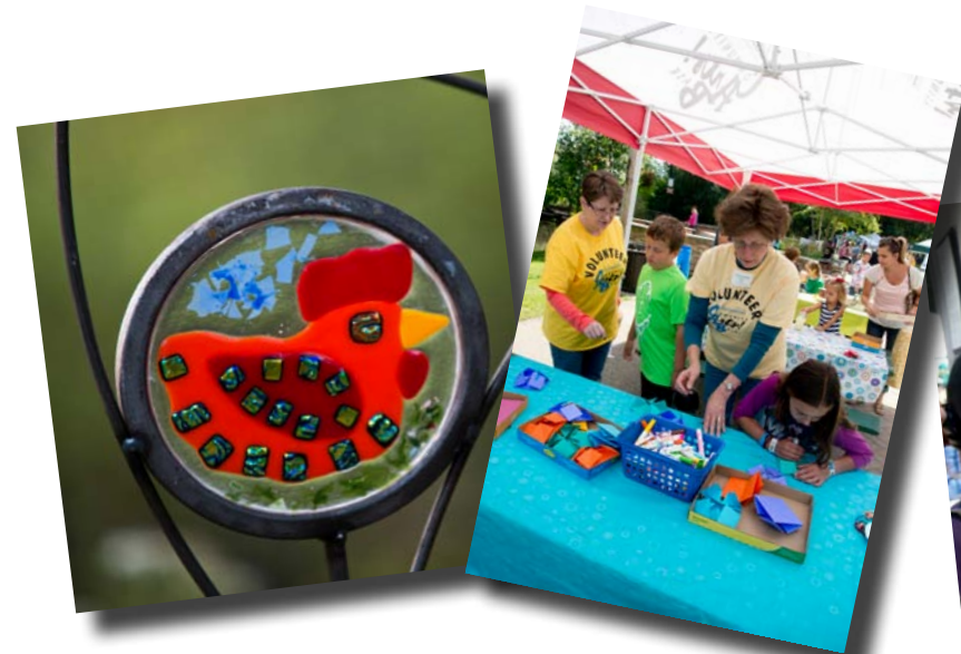
Art on the Kinni!

On Saturday, September 10 the White Pathway will host the 21st Annual Art on the Kinni!